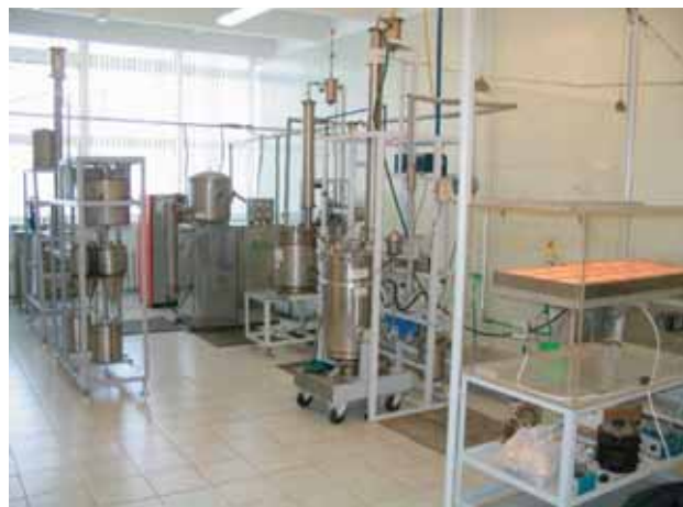
The Pilot Facility for production of biodegradable polymers established in the Institute of Biophysics SB RAS (Krasnoyarsk)

Although in recent years biomaterials science has had great achievements, no materials have yet been designed that would be fully compatible with a living organism. One of the serious factors that limit the use of biodegradable polymers is their quite narrow range. Another limitation is that no one has so far solved the problem of controlling the rate of biopolymer degradation in the living organism (different medical tasks require different degradation rates),