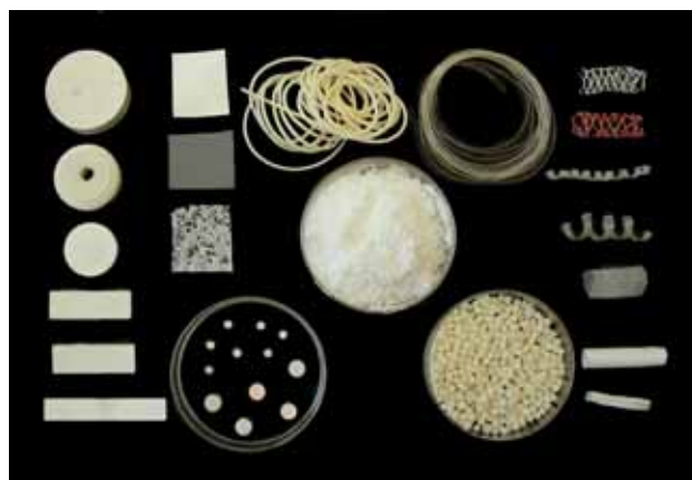
A family of bioplastotan-based experimental items intended for medical uses

Microstructure of bioplastotan 2D matrixes (scaffolds to be loaded with drugs and used as drug-delivery systems and ones intended for culturing cells): a—flexible film; b—membrane prepared using leaching technique; c—membrane prepared by precipitation in the “PHB-chloroform-tetrahydrofuran” three-component system. Electron microscopy .